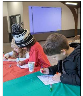
Photo Descriptions: Neighbors gathered enjoying watching the movie ( top ), taking selfies with the holiday backdrop ( bottom left ), and coloring and enjoying holiday activities ( bottom right ).